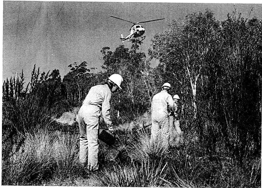
Hazard reduction burn.

In largely cleared agricultural landscapes, the introduction of plantations breaks up potentially large contiguous areas of fire vulnerable crops and pastures, which could otherwise carry fast moving fires, that can burn vast areas in relatively short periods of time.